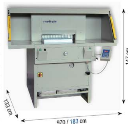
Displayed machine includes optional equipment "side tables".

Packaging: on palett L/W/H 117 x 156 x 167 cm