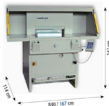
Displayed machine includes optional equipment "side tables".

Packaging: on palett L/W/H 110 x 137 x 167 cm