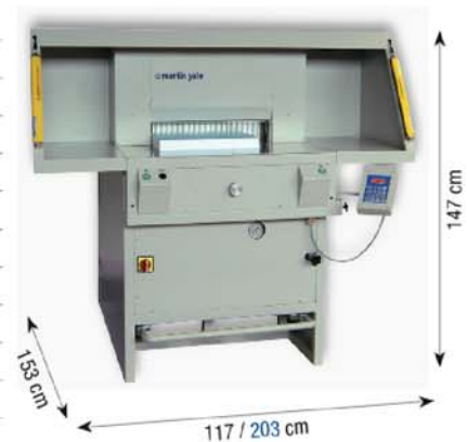
Displayed machine includes optional equipment "side tables".