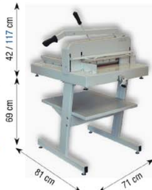
Stand and shelf are optional equipment