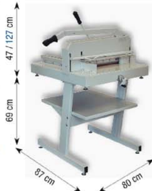
Stand and shelf are optional equipment