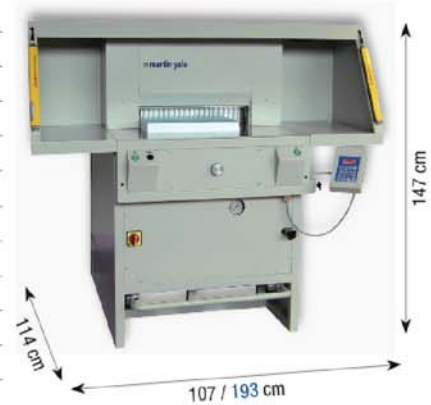
Displayed machine includes optional equipment "side tables".