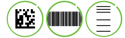
4. Auto Diversion

The feeders can be linked for cascade feeding. If one feeder runs empty, another one takes over, given a total capacity of 2000 sheets. The standard feeders contain empty sensors for auto-start after refilling the feeders.