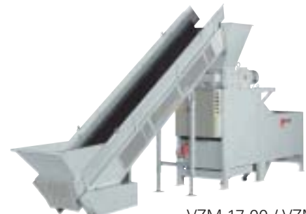
VZM 17.00 / VZM 18.00 Inline set-up