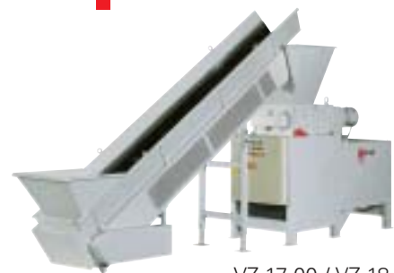
VZ 17.00 / VZ 18.00 Inline set-up