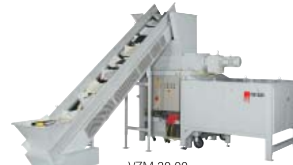
VZM 20.00 Angular set-up, 90° right