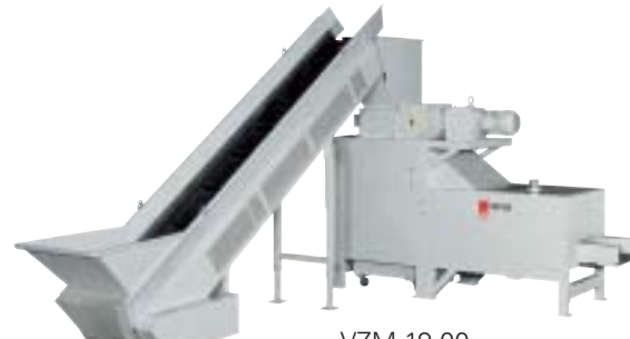
VZM 19.00 Angular set-up, 90° right